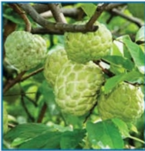
CUSTARD APPLE PLANTS

With 15 years free maintenance of plantation get the best farm plots with self-sufficient & low volatility right here!