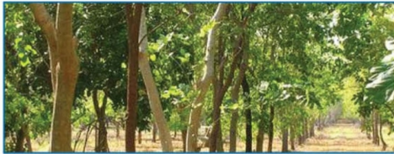
WHITE SANDALWOOD FARM PLANTS